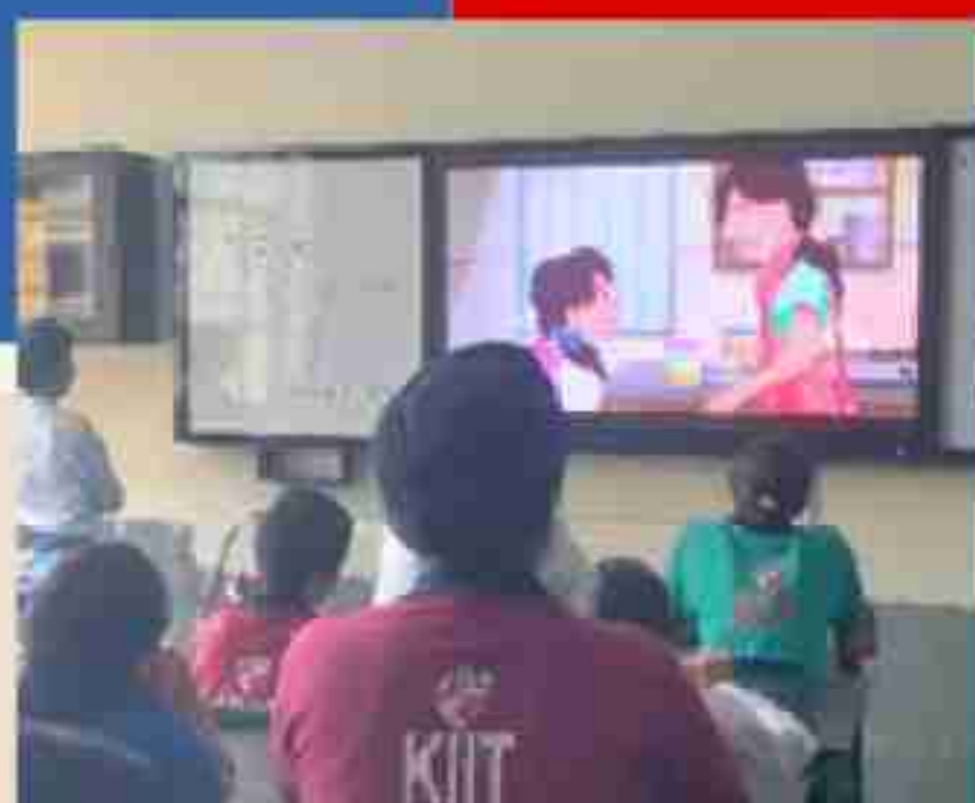
HEALTH & WELLNESS