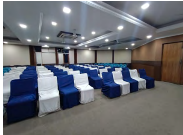
The Conference Hall sees upgradation