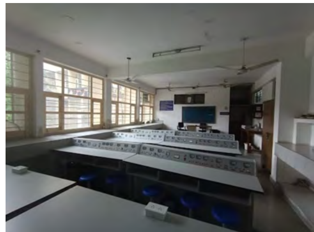
Physics Lab: State-of-art panels for experiential learning