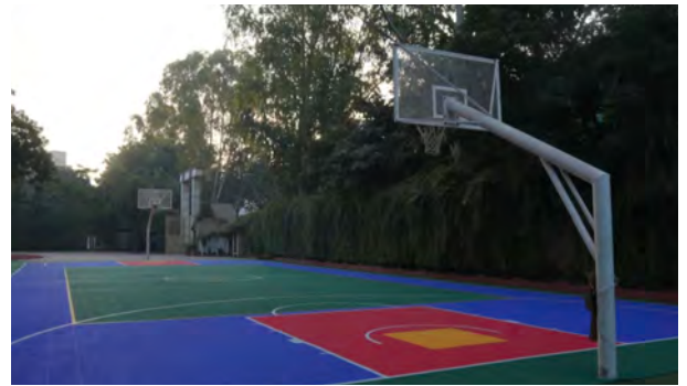
Basketball court paved with premium rubber tiles