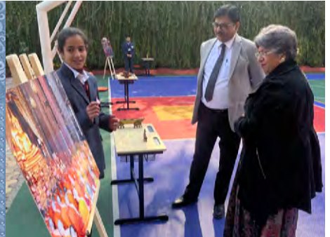
Students put up captivating displays on facets of our heritage