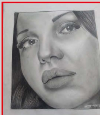
Navya XI Connected leaders