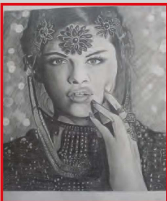
Navya XI Connected leaders