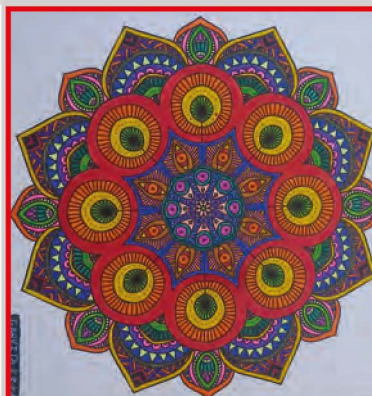
Garvita XII Connected leaders