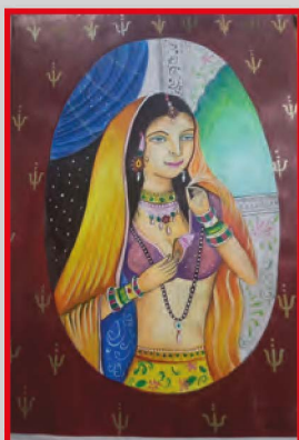
Navya XI Connected leaders