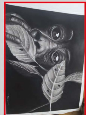
Navya XI Connected leaders